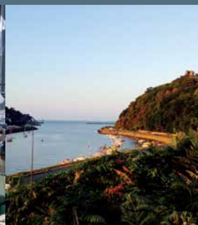
The Tour de Cesson watches over the port Entrance to the Légué port