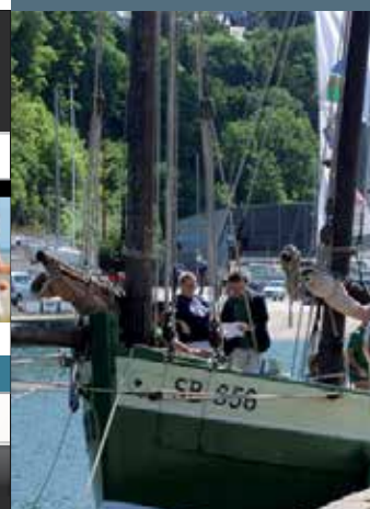
Le Grand Léjon Traditional sailing boat

At the mouth of the coastal river of Gouet, a port in the past oriented towards large-scale fishing, has evolved towards pleasure and commercial activities. Restricted by its bay head position in the line of the powerful tide, the Légué port was built from the desire of the boat-builders to gain even more access to the sea. Follow the quays and lift your gaze. On both sides of the marina, the maritime history reveals itself little by little.