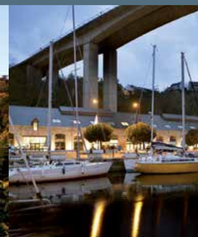
Le Carré Rosengart, Quai Armez