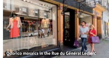
Odorico mosaics in the Rue du Général Leclerc