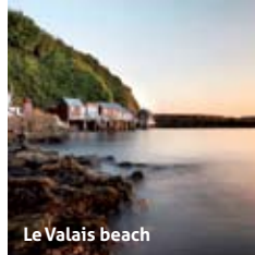
Le Valais beach