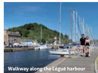
Walkway along the Ligué harbour

Large collections of art and ethnological artefacts. Models, drawings, earthenware, tools and clothes reflect the huge diversity of themes presented: underwater archeology, maritime heritage, slash-and-burn agriculture and weaving, crafts and community life. Discover the new "Breton clichés?" path, reworked using the museum's collections. With its national events (Museum Nights, National Heritage Days, Archaeology Days), the museum has a whole programme planned out...and you can visit it for free!